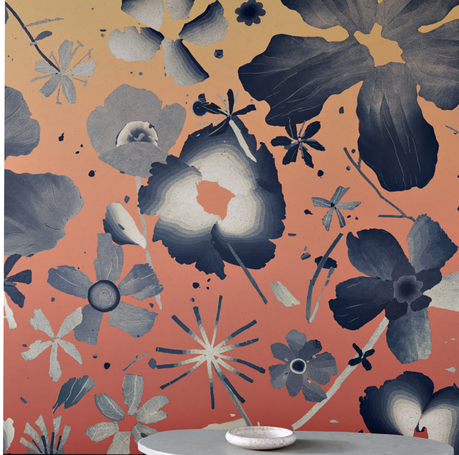
Ceramics by New York-based artist Cody Hoyt are translated into Botánica Vitality, a wallpaper or Type II commercial-grade PVC-free wallcovering by Calico. calicowallpaper.com