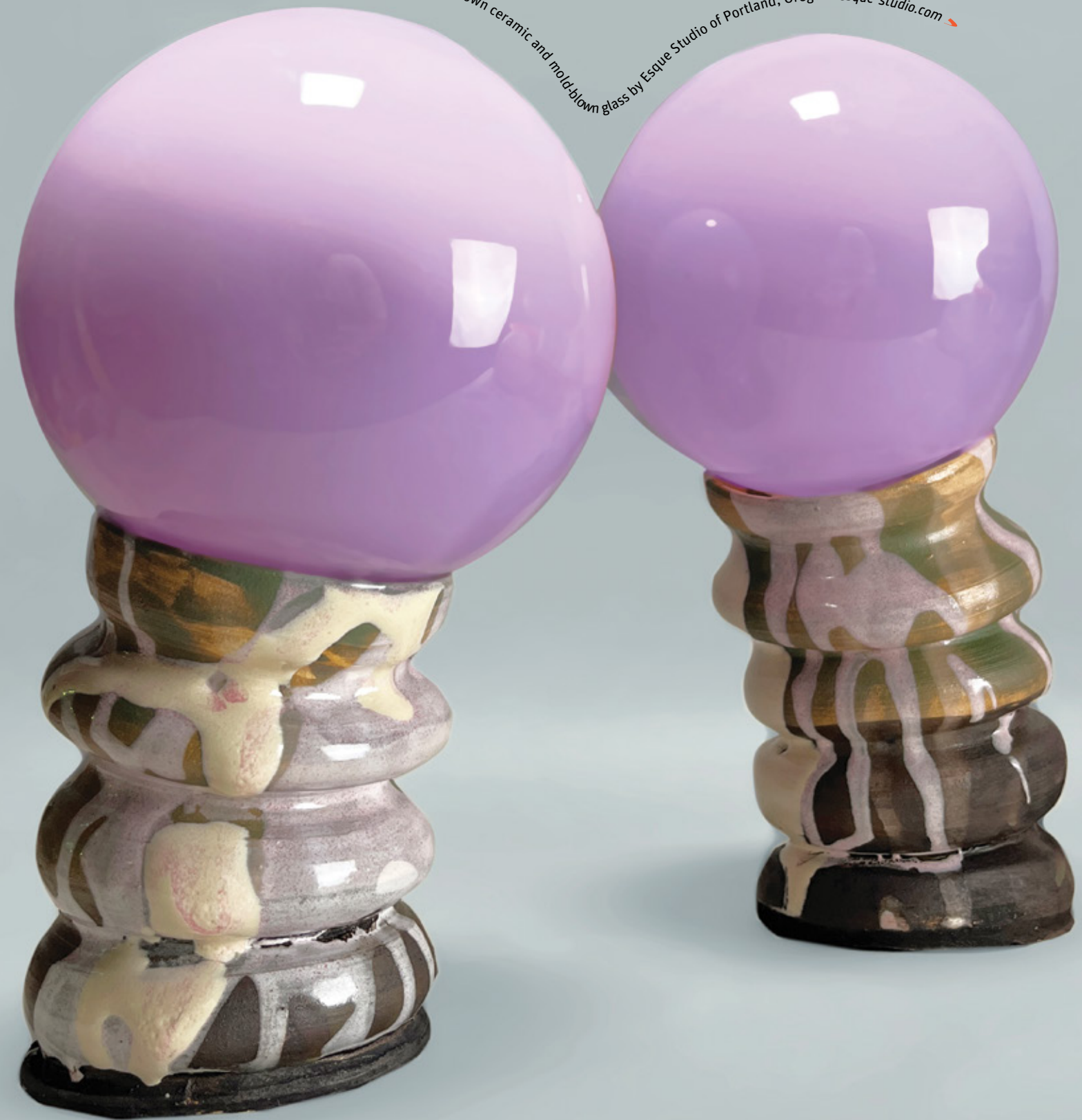
Andi Kovel's Contour lamps in glazed hand-thrown ceramic and mold-blown glass by Esque Studio of Portland, Oregon. esque-studio.com