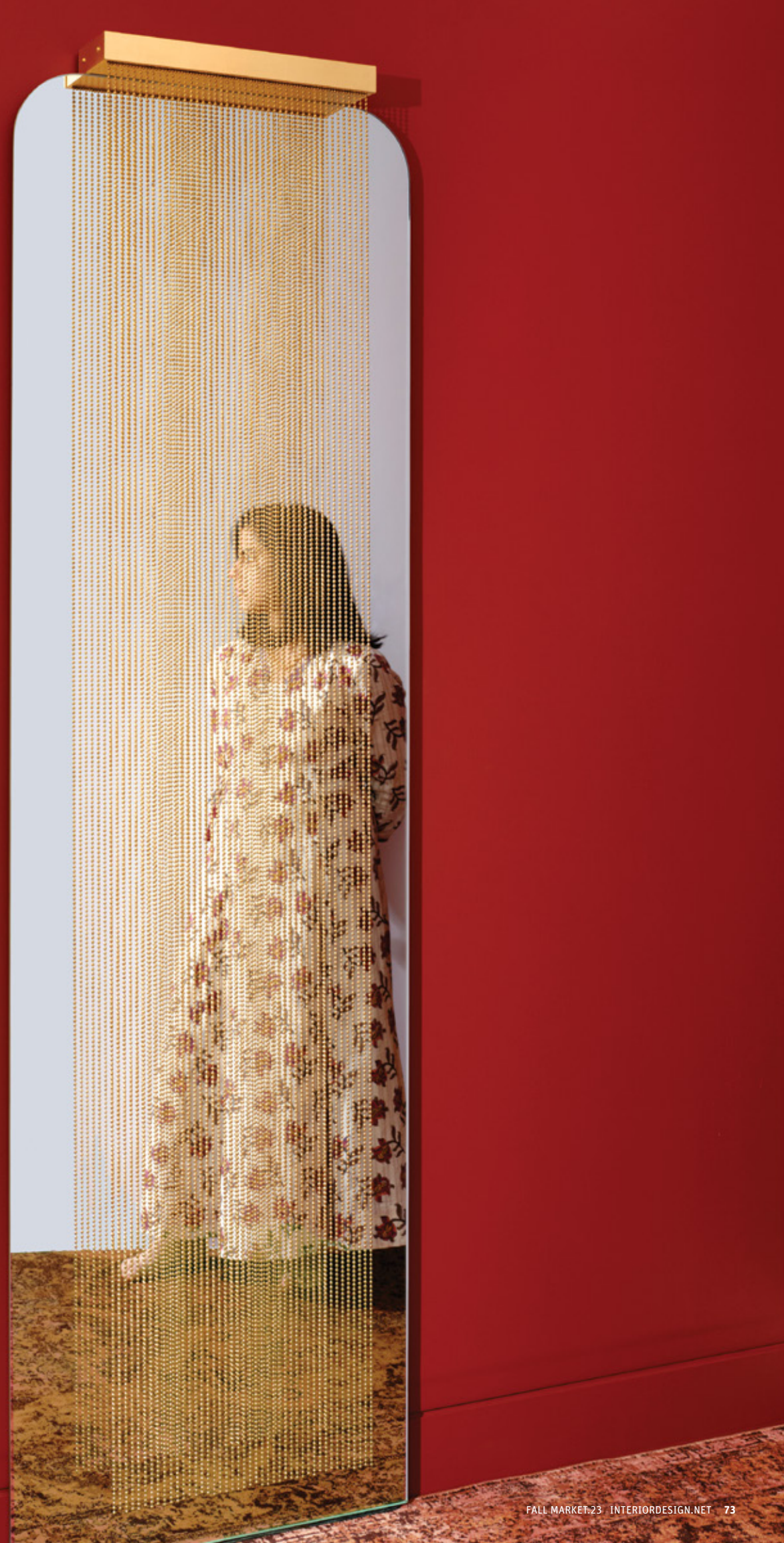
Purdah mirror with a reflection-softening brass veil suspended from a gilded bar, by Urvi Sharma and Manan Narang of Providence, Rhode Island, studio INDO. | indo-made.com