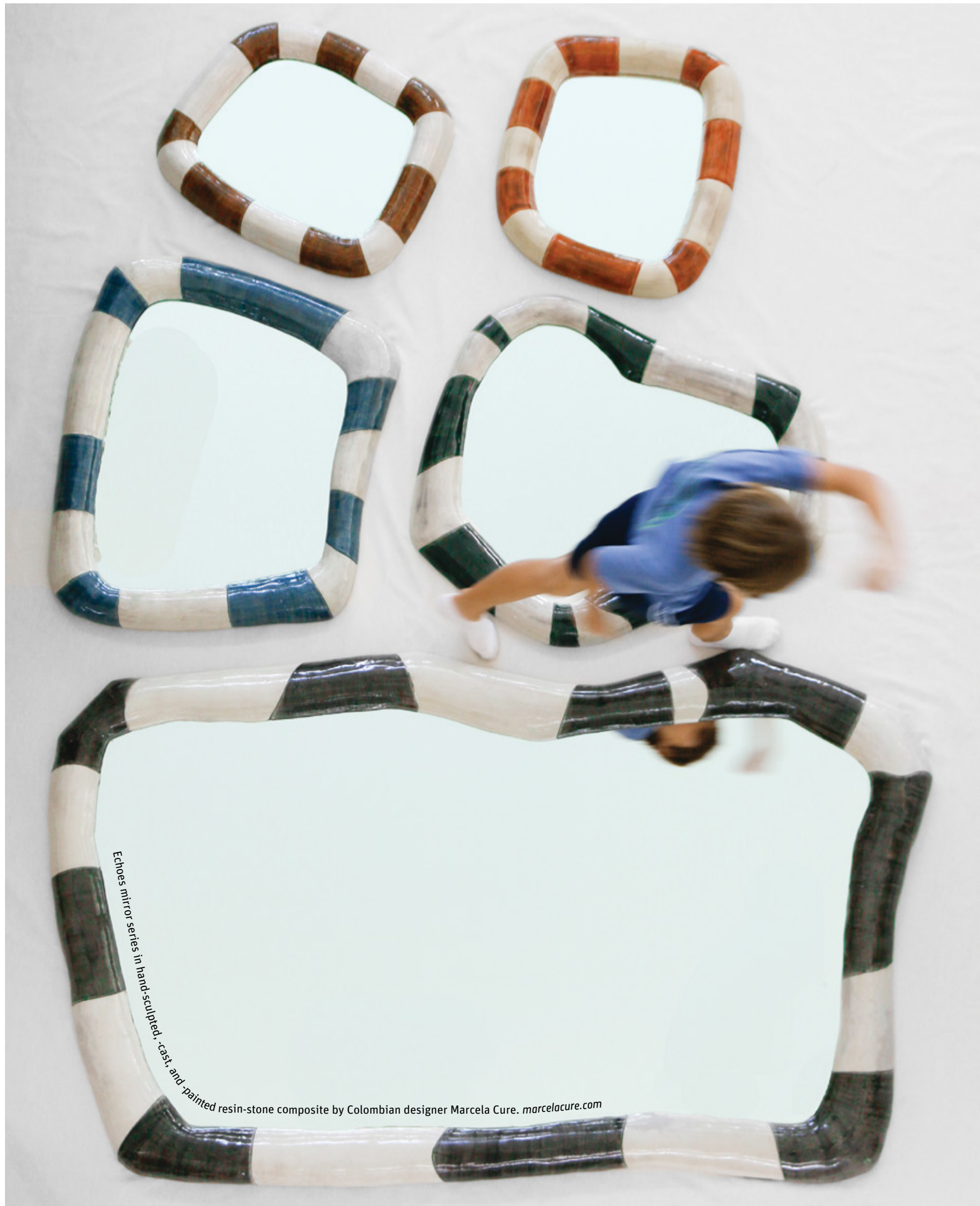
Echoes mirror series in hand-sculpted, cast, and painted resin-stone composite by Colombian designer Marcela Cure. marcelacure.com